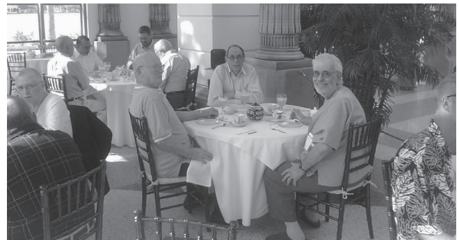
High Tea at Flagler Museum...