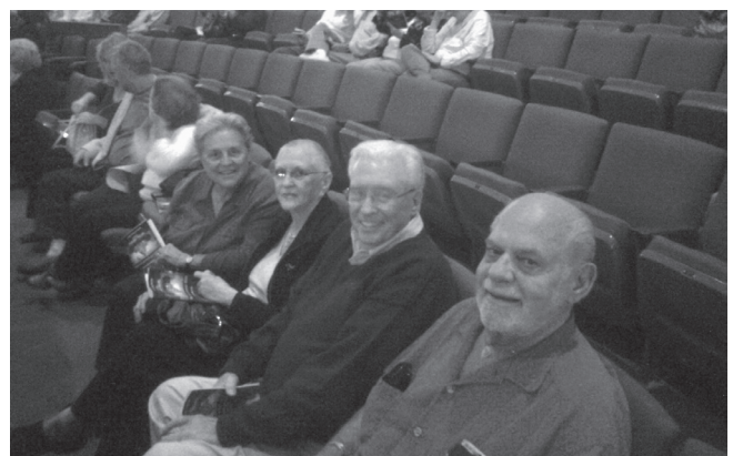
Original Florida Follies at Parker Playhouse...