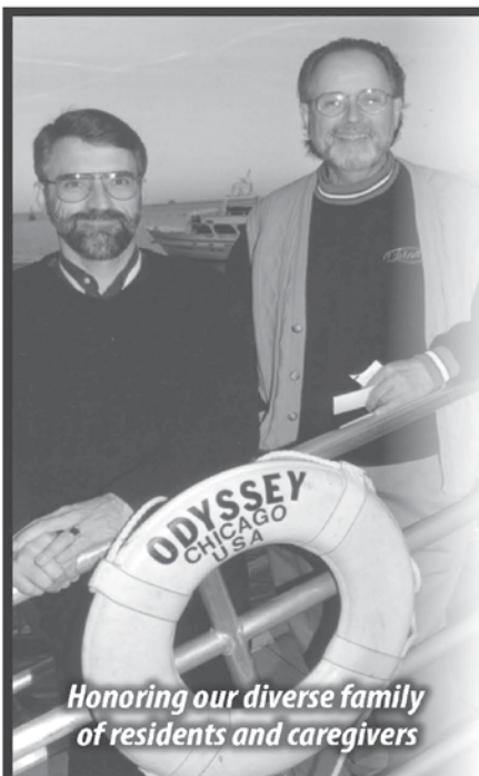
Honoring our diverse family of residents and caregivers

PAID ADVERTISING - PAID ADVERTISING - PAID ADVERTISING - PAID ADVERTISING - PAID ADVERTISING